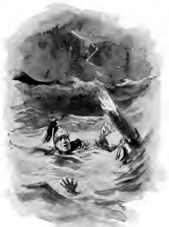
"THEIR HOSTS, ARRIVED IN TRAPPINGS OF THE BATTLE- FIELD, AYE WHELMED."— Page 203.